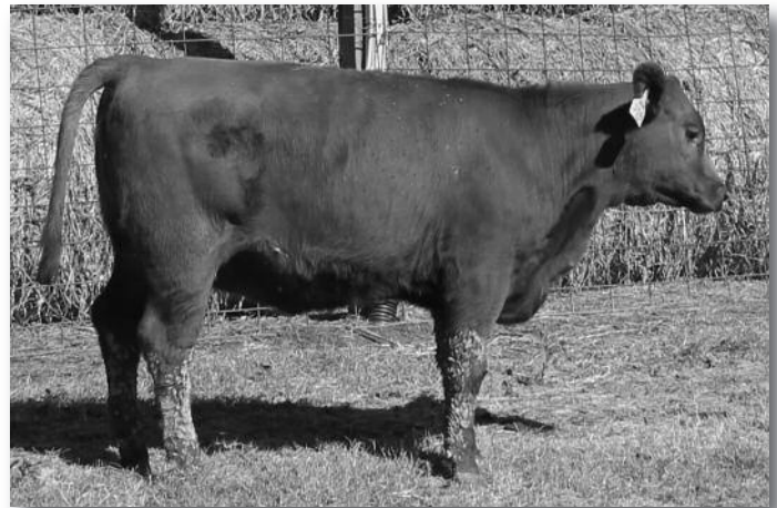
JEM Robin 142C • Lot 45