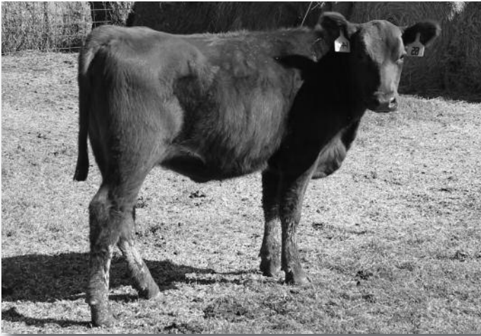
Lot 65 Commercial Heifer

We will keep our focus fixed, because we are dedicated to providing our customers with the very best, established, and proven genetics to keep your profitability our top priority.