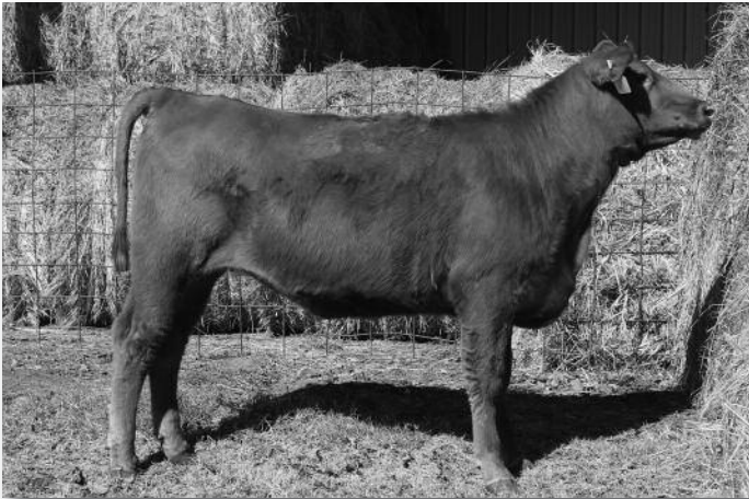
Scots Mimi XT • Lot 49