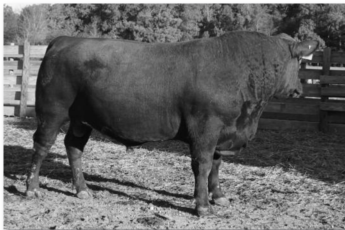
Osborn Thunder 1521 • Lot 16

Lots 17 – 33 are yearling bulls and have been raised with a TMR of alfalfa hay, and mixed grains.