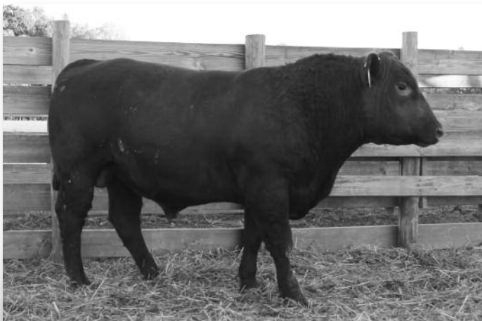
97S 1501 Global • Lot 14