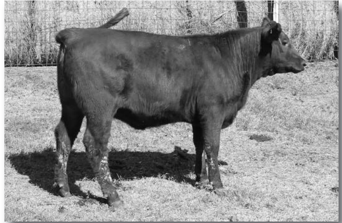
Commercial Heifer • Lot 44