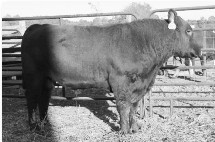
Osborn Thunder 1533 • Lot 15