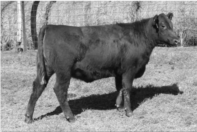
JEM Lillie 130C • Lot 42