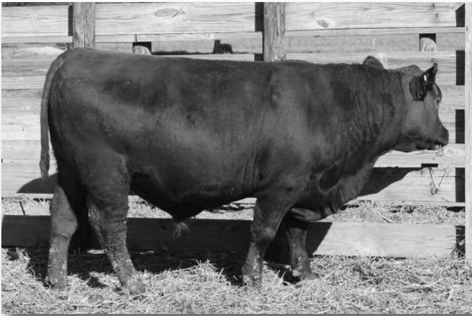
JEM Exclusive 140C • Lot 19