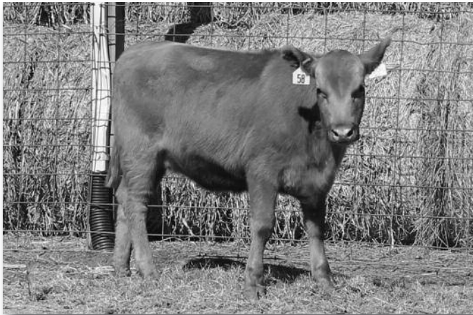
JEM Dynette 150C • Lot 58