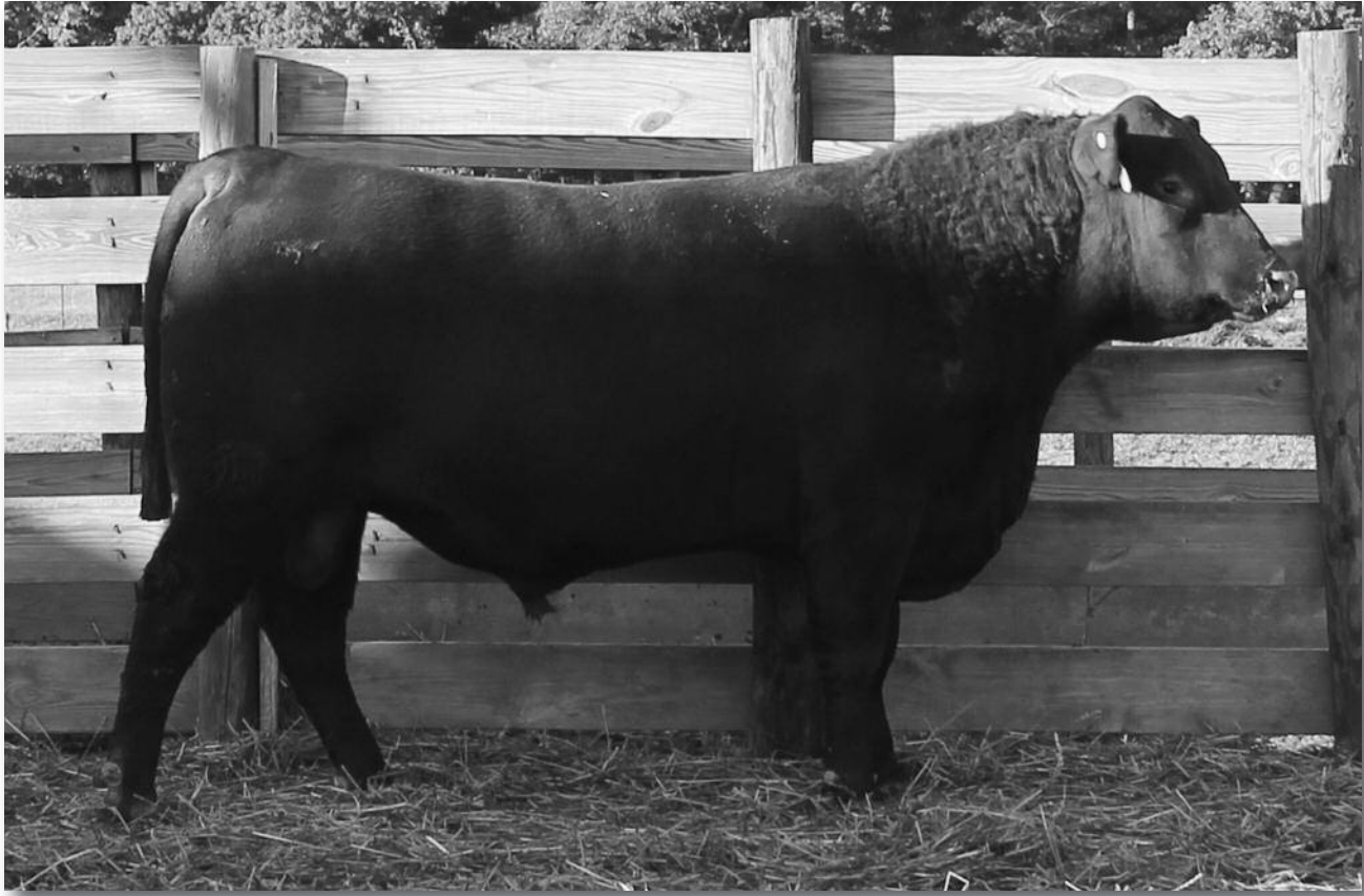
Osborn Thunder 1525 • Lot 2

Lots 2 – 16 are coming two-year-old bulls that are ready to go right to work. They were summered on grasses with no feed added to their diets until the second week of October when we added a small grain ration to their diets in preparation for the sale.