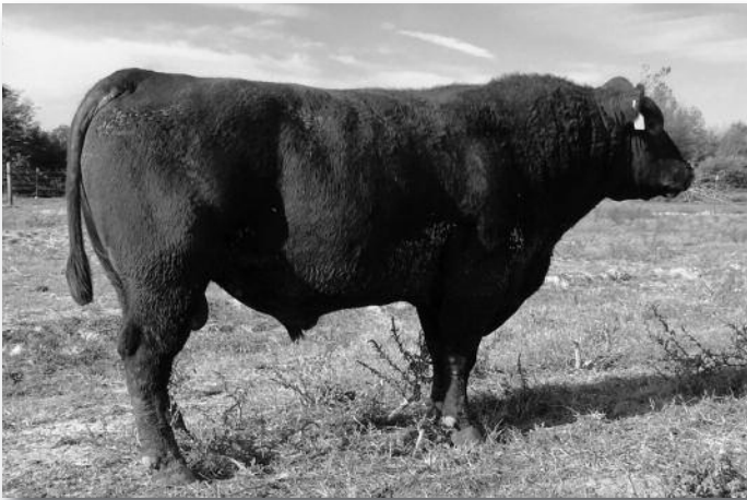
Andras Thunder 2082 • Lot 1