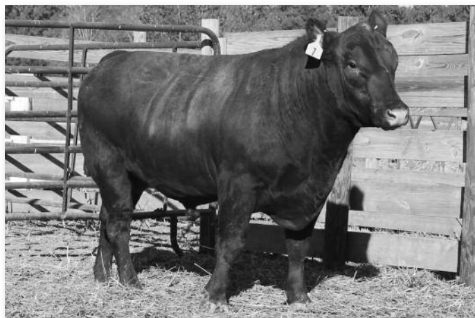
Osborn Thunder 1504 • Lot 7