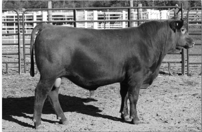
Osborn Legend 1597 • Lot 29