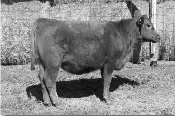
Osborn Omak 113C • Lot 41