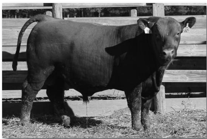
FORU64C T30 • Lot 30