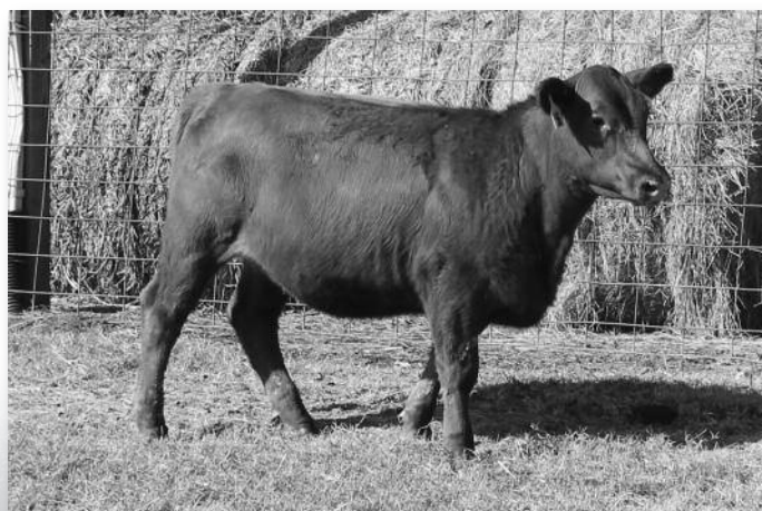
JEM Sara 122C • Lot 56