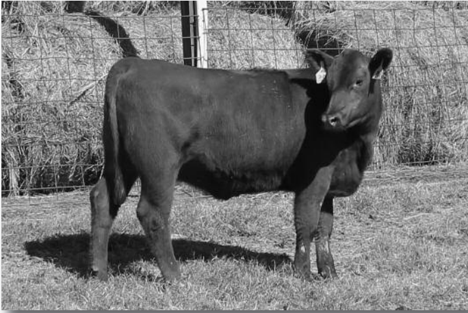
JEM Sophie 115C • Lot 48