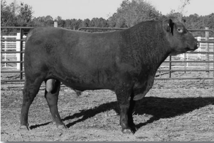
Osborn Thunder 1515 • Lot 4