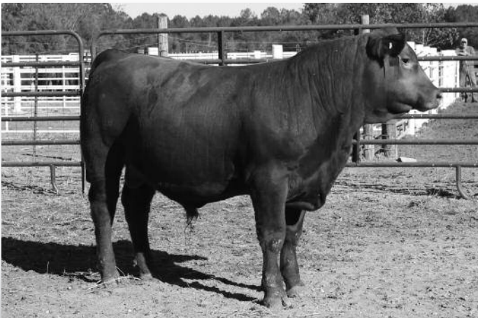
Osborn Legend 125C • Lot 28