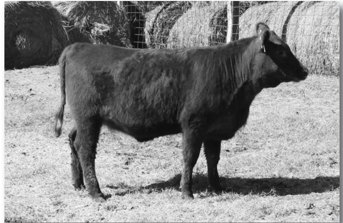
JEM Ms Direction 118C • Lot 38