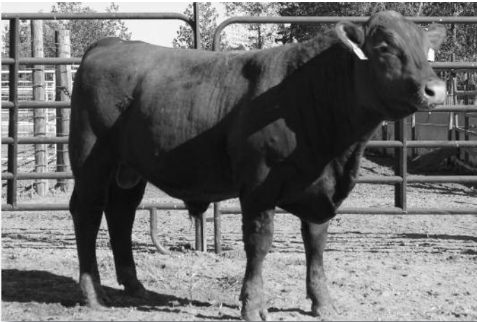
FOR348CNWPQ • Lot 27