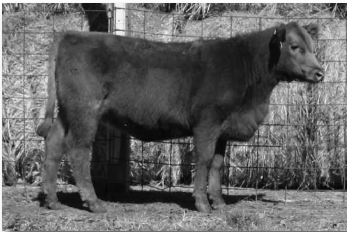
Osborn OSCE 127C • Lot 59