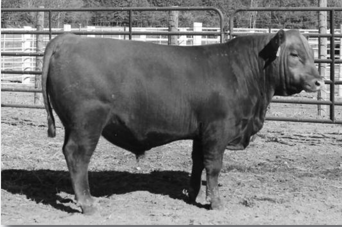
JEM Legend 135C • Lot 26