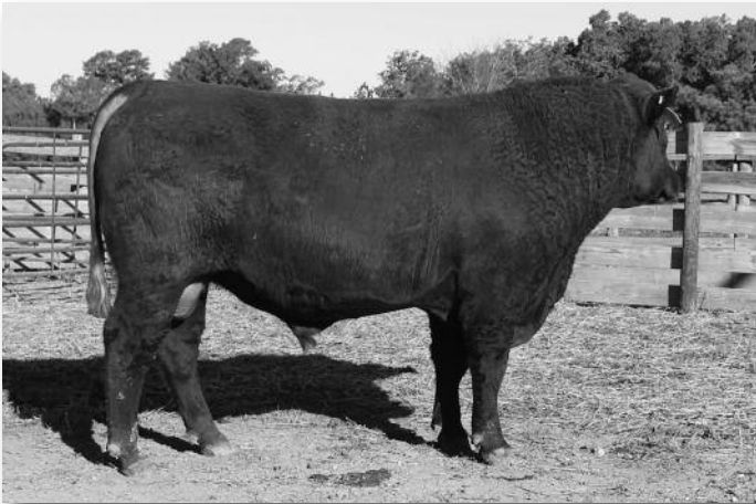
JEM Thunder 1527 • Lot 5