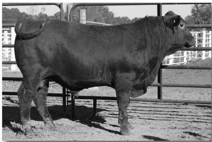
JEM Thunder 130C • Lot 21