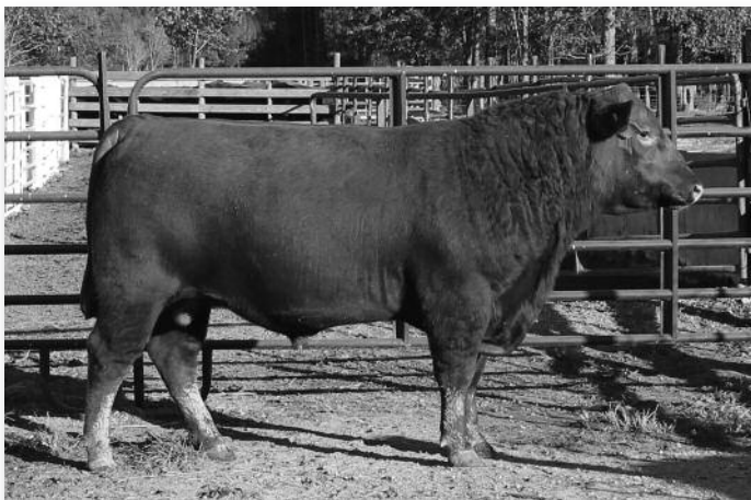
JEM Thunder 1514 • Lot 12