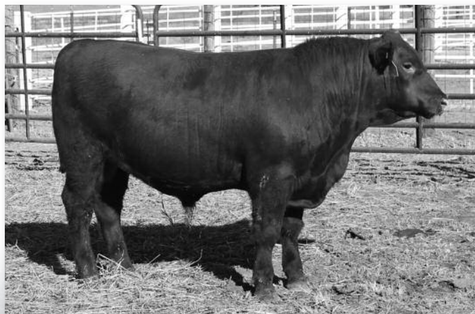
Osborn Director 139C • Lot 17