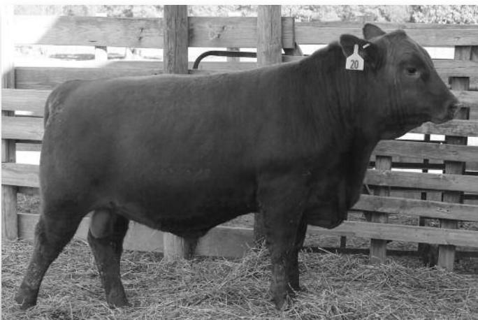
Osborn Legend 126C • Lot 20