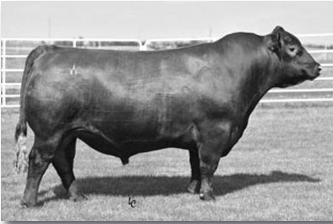
Andras New Direction R240 • Sire of Lot 18