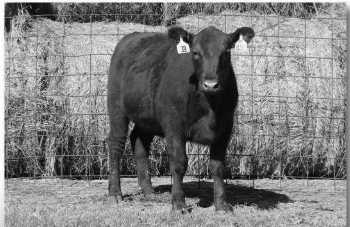
JEM Sara 141C • Lot 39