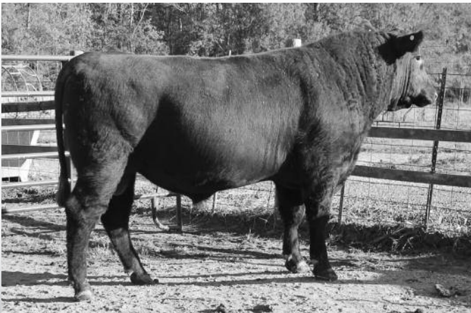
Osborn Thunder 1526 • Lot 6