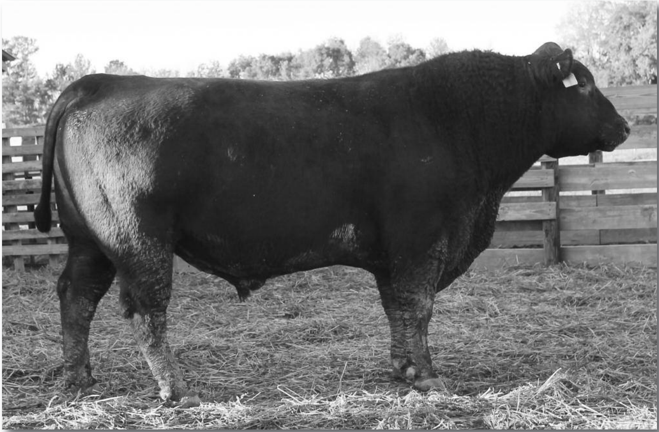
Andras Thunder 2082 • Lot 1