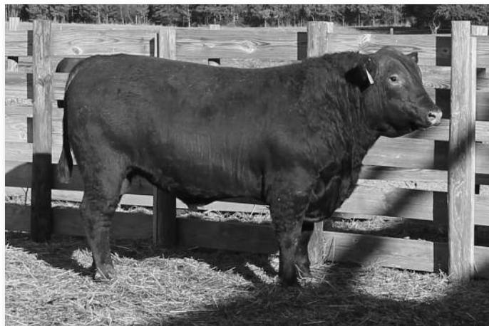
Osborn Thunder 1511 • Lot 9